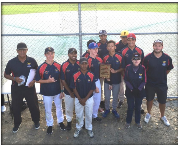
1st Place – Mt Roskill Grammar School