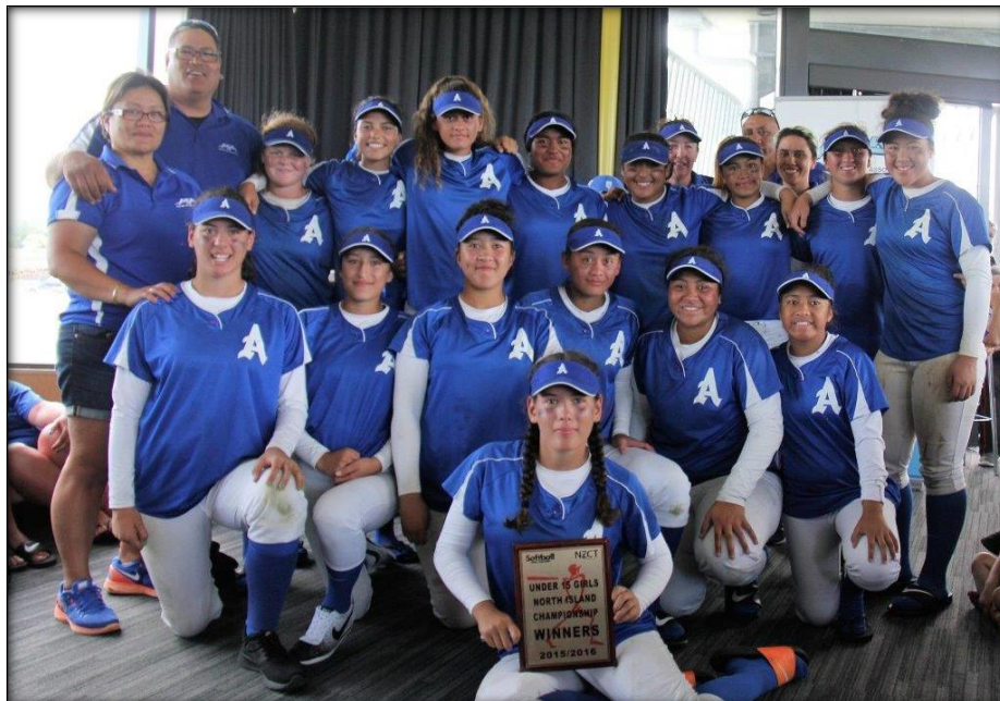
1st Place – Auckland