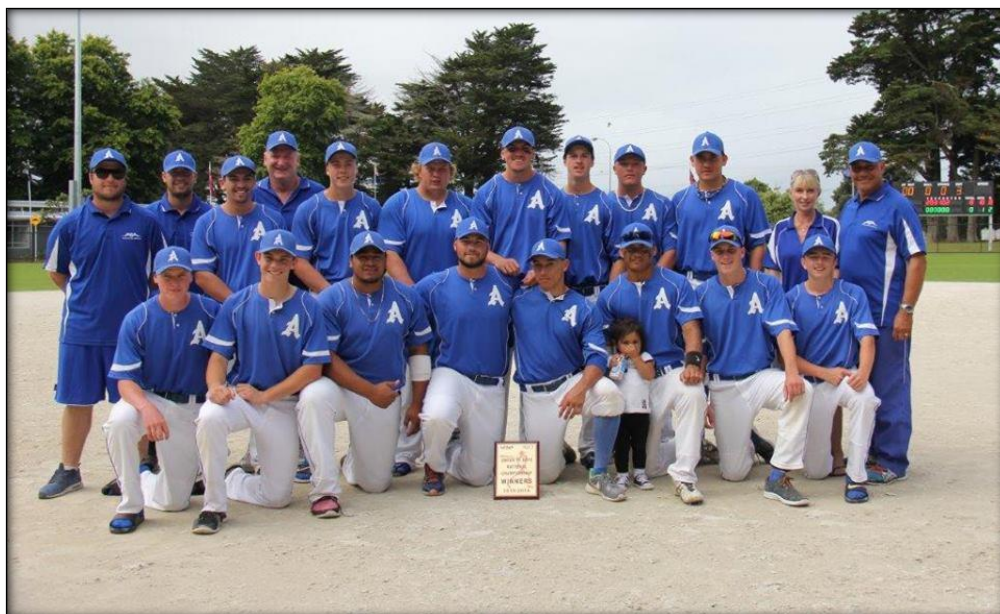
1st Place - Auckland