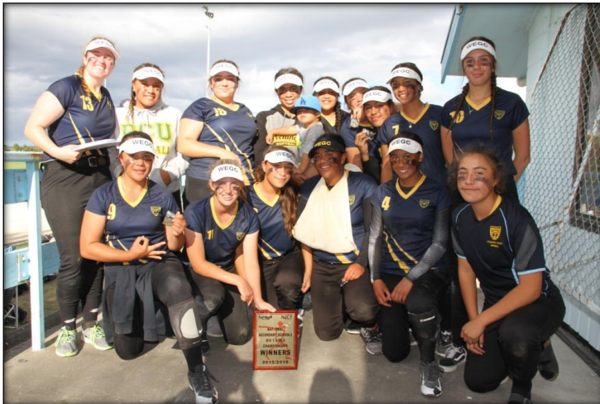
1st Place – Wellington East Girls College