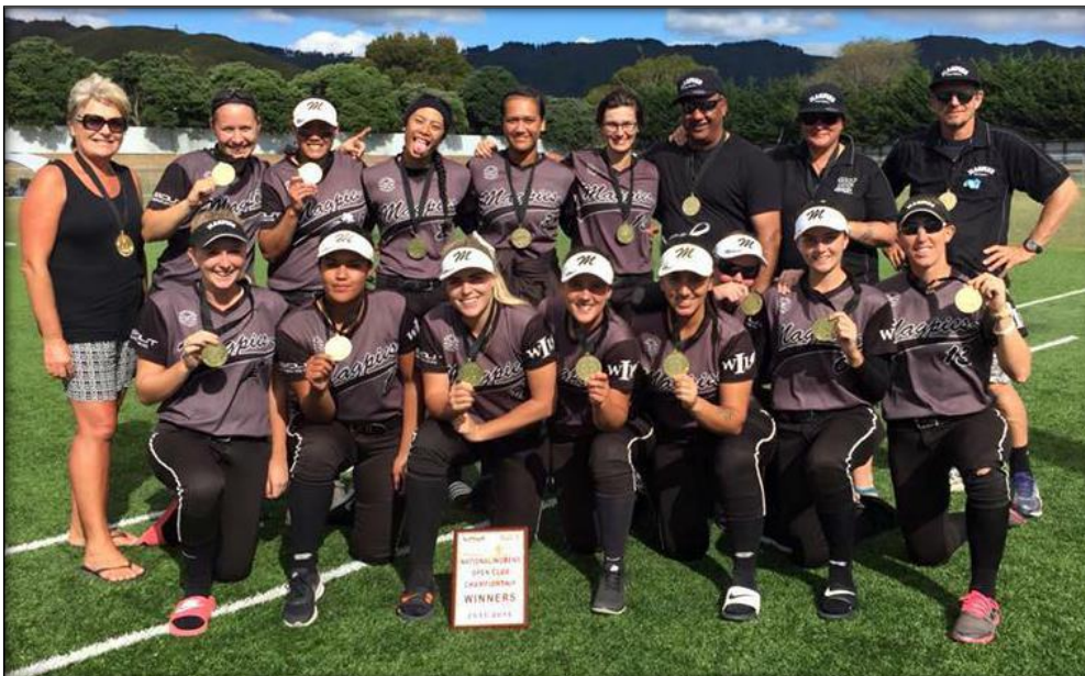
1st Place – Western Magpies