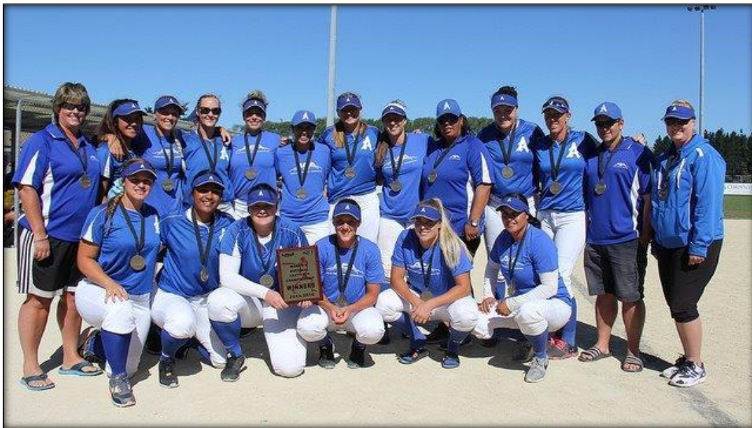
1st Place - Auckland