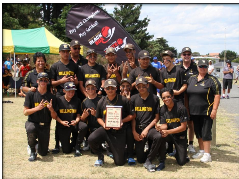
1st Place – Wellington