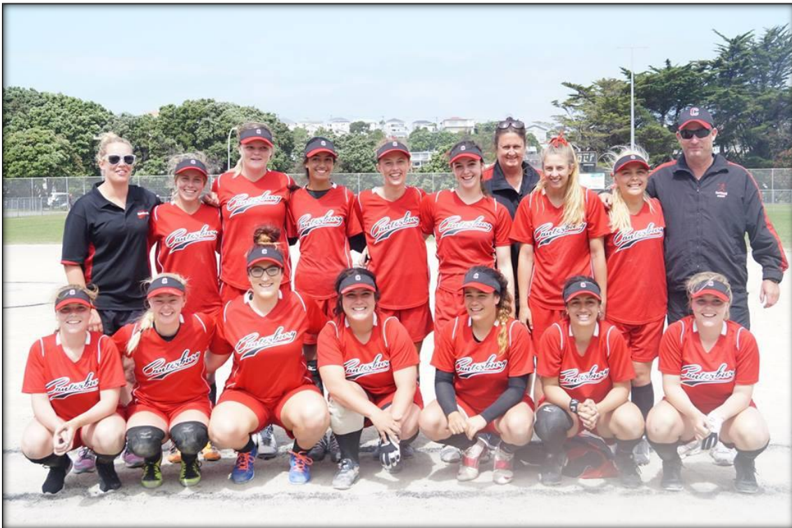
1st Place - Canterbury