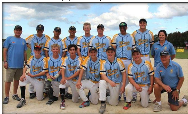
1st Place - Mt Albert Grammar School