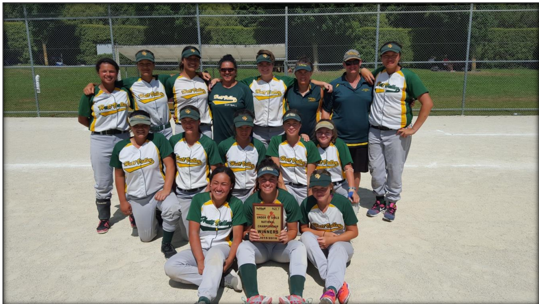
1st Place – Hutt Valley