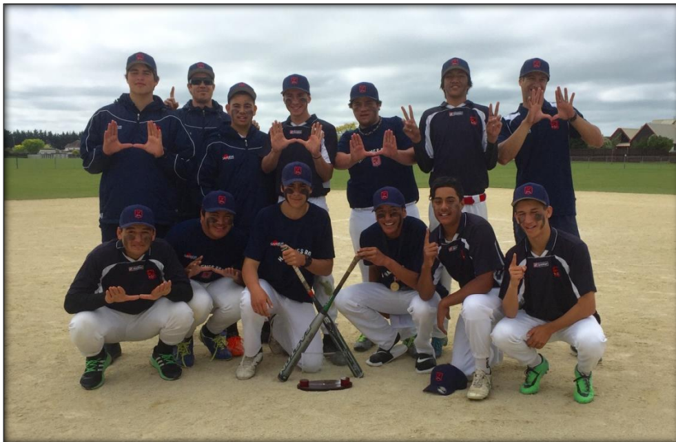
1st Place - Hastings Boys High School