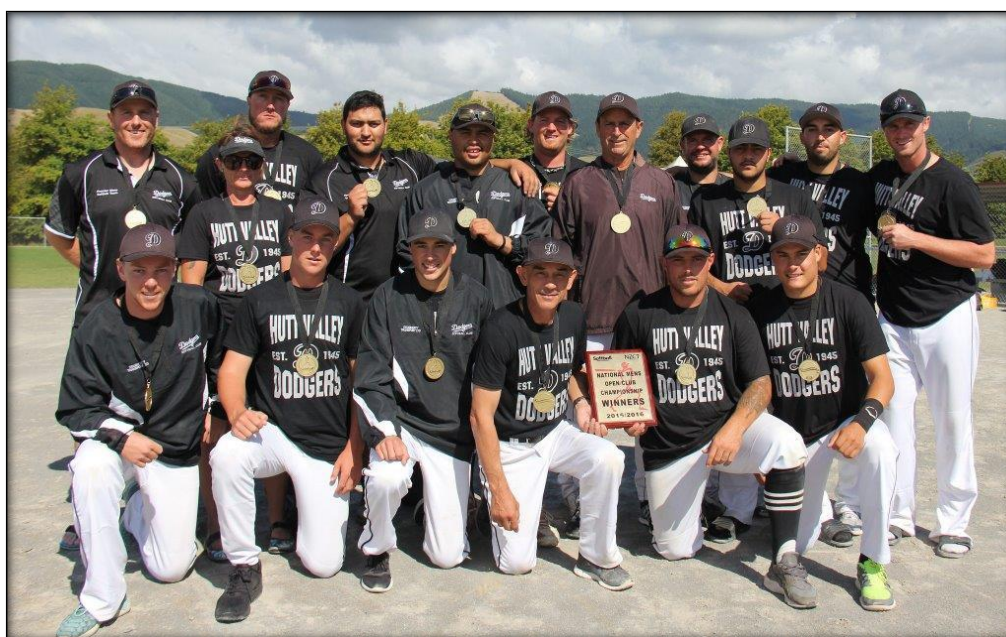
1st Place – Hutt Valley Dodgers