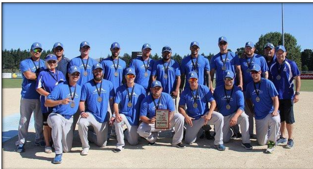
1st Place – Auckland