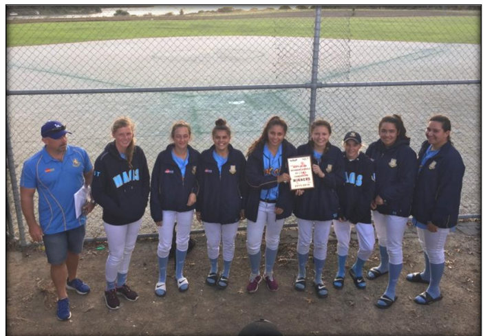
1st Place - Mt Albert Grammar